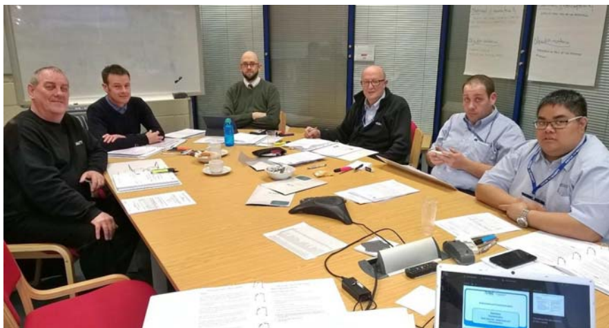
Above: TEC Transnational conduct training session with delegates from engineering giant Meggitt.

TEC Transnational today announced that it had successfully delivered its 300th training place for engineering firm Meggitt.